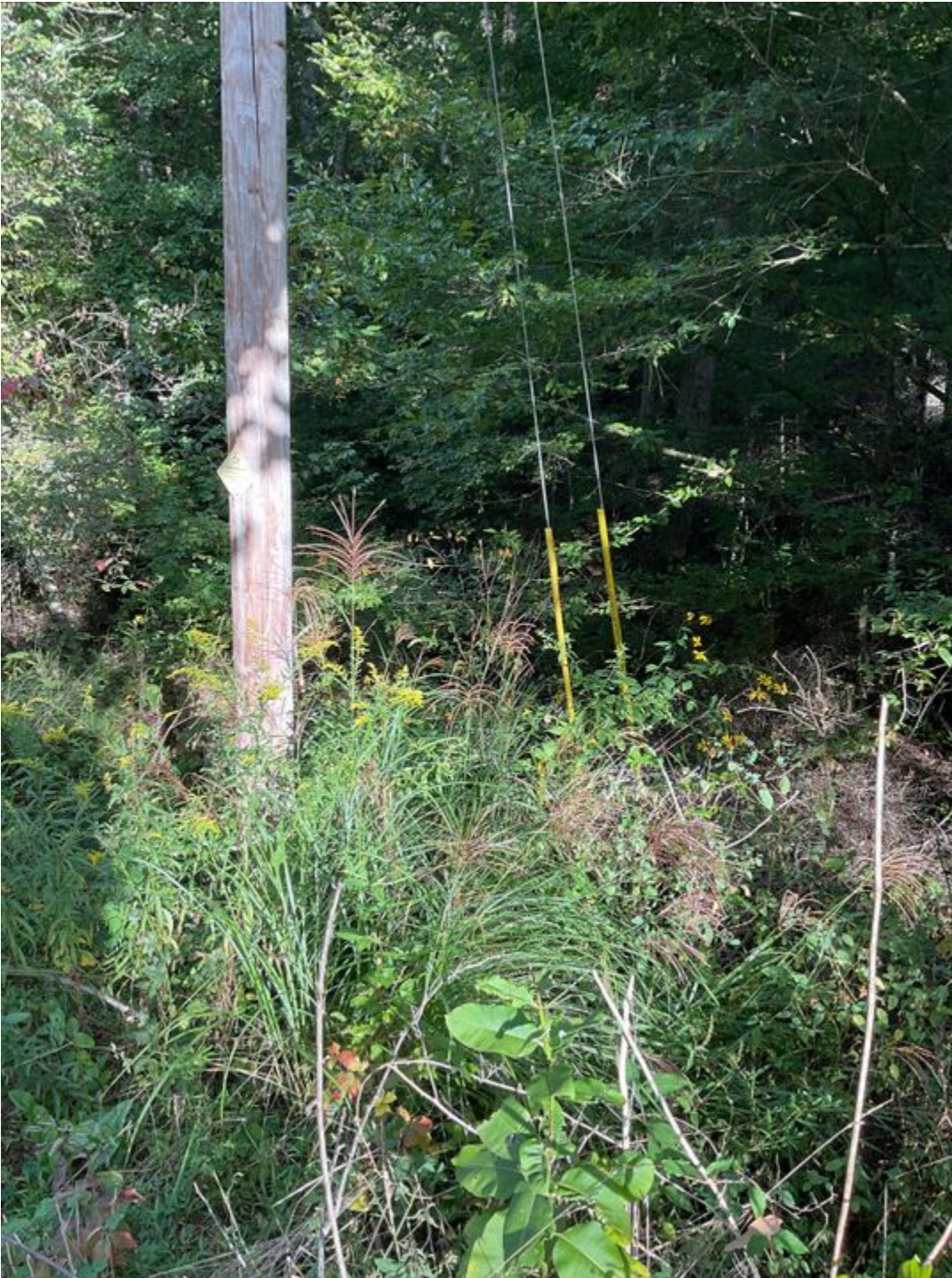
Image #3 Text: Other Road crossing of tributary. Sign in place as well as fencing.

Date & Time: September 11, 2024 8:51 AM Location: 35.829346, -82.501092 Photo Direction: Northwest